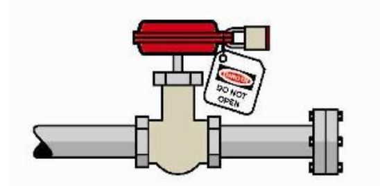
Figure 1: Open end of pipe capped. Nearest valve closed locked and tagged.

Removing a valve, spool piece or expansion joint in piping leading to the confined space and blanking or capping the open end of the piping. The blank or cap should be tagged to indicate its purpose. Blanks or caps shall be made of a material that is compatible with the liquid, vapour or gas with which they are in contact. The material should also have sufficient strength to withstand the maximum system design pressure.